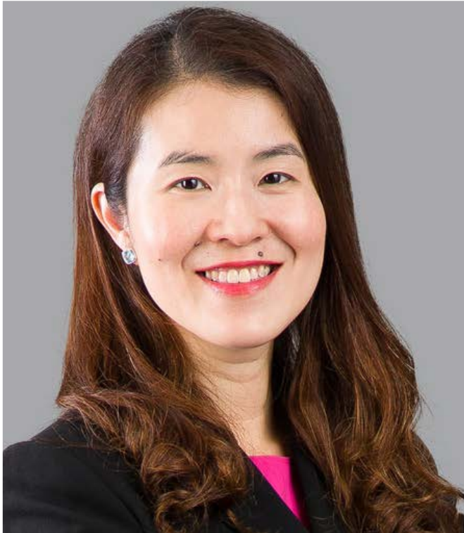
SIA AIK KOR CHIEF EXECUTIVE COMPETITION AND CONSUMER COMMISSION OF SINGAPORE

CCCS is pleased to usher in the new year with readers of In The Act. In this issue, we cast the spotlight on key cases that CCCS successfully concluded over the past few months.